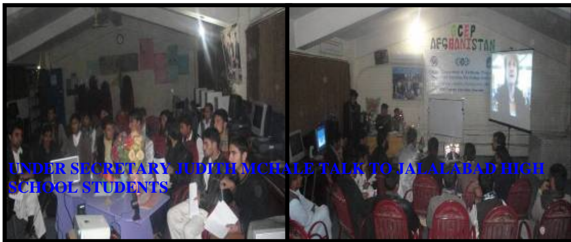
UNDER SECRETARY JUDITH MCHALE TALK TO JALALABAD HIGH SCHOOL STUDENTS