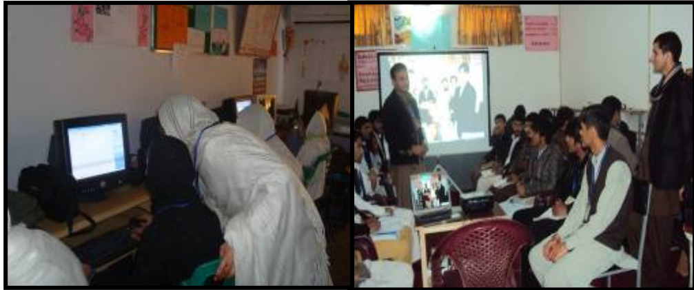
GCE IT Trainers during the lecture

In total 1669 (979 male students and 680 female students) from 13 high schools (including multiple schools using the CETC main computer lab) participated in GCEP program since August 2008 in Jalalabad Nangarhar. Many of these students actively interact with students in the US using the internet.