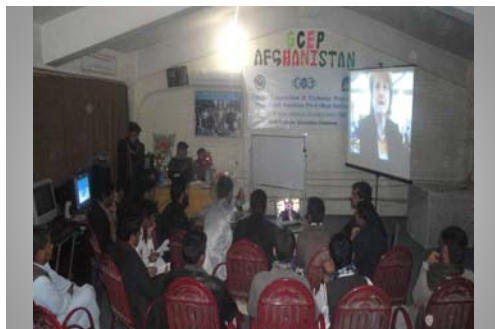
UNDER SECRETARY OF STATE JUDITH MC HALE TALKS TO JALALABAD HIGH SCHOOL STUDENTS VIA SKYPE

Students from various high schools in Jalalabad met at one of our central sites and participated in a live video conference call with students in the United States. Judith McHale, under Secretary of state for Educational and Cultural Affairs, participated in this conference.