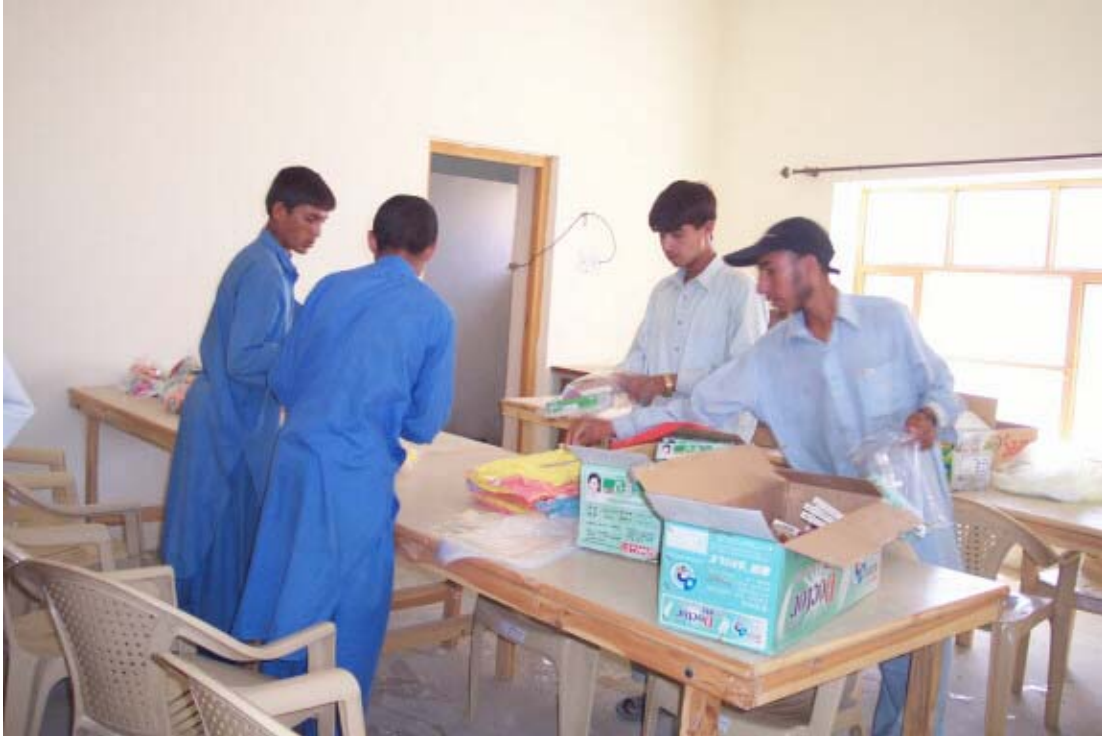
Students at Jalalabad Rotary School assembling personal hygiene kits with funds purchased by penny drive at Doyle Elementary, its Sister School.