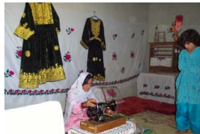
Micro credit beneficiary making dresses