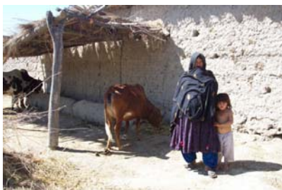
Micro credit beneficiary with her cow.