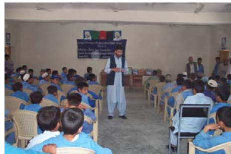
Students at Rotary School listening to personal hygiene lecture provided by Jalalabad physicians.